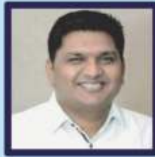
Shri. Prajakt Tanpure

Hon'ble Minister Higher & Technical Education