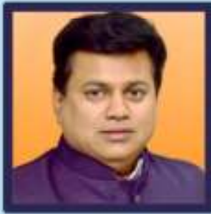
Shri. Uday Samant

Hon'ble Minister Higher & Technical Education