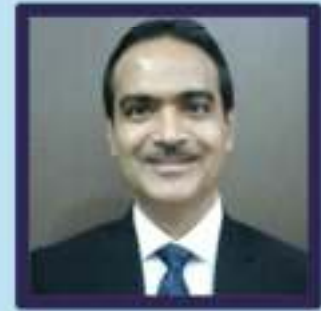
Shri. O. P. Gupta IAS

Hon'ble Minister of State Higher & Technical Education