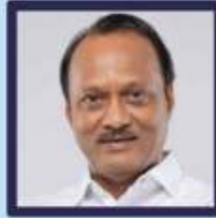
Shri. Ajit Pawar