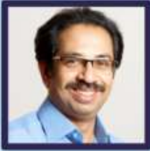
Shri. Uddhav Thackeray